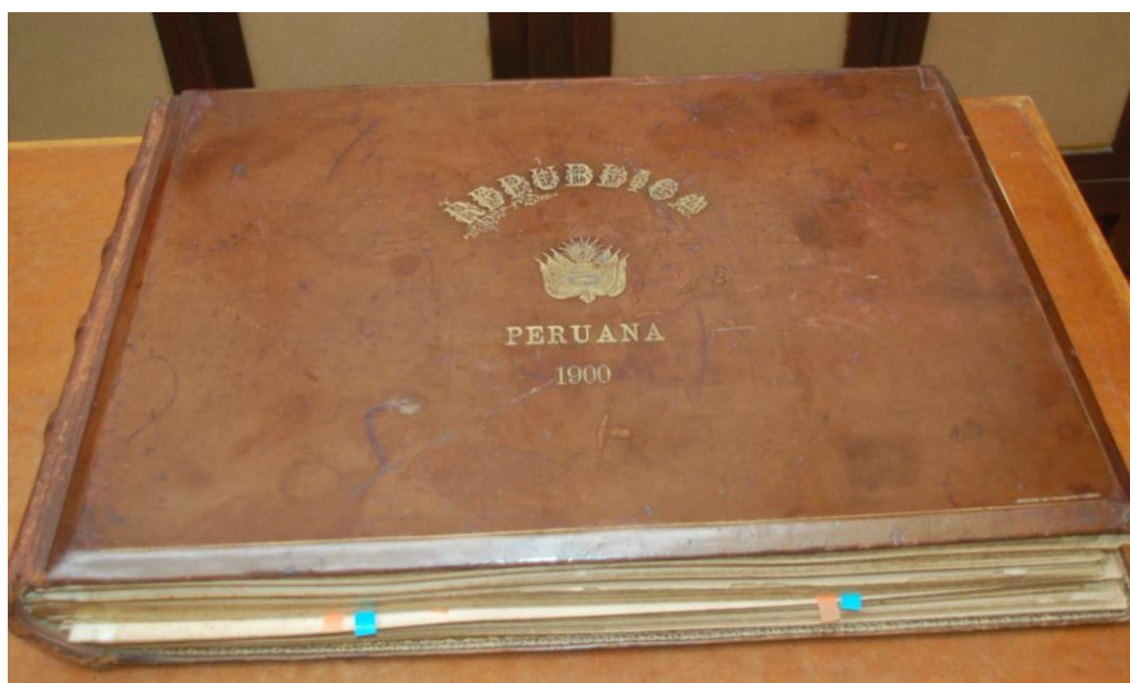
Cover of the album República Peruana 1900 , edited by Fernando Garreaud for its exhibition at the Universal Exhibition of Paris in 1900.