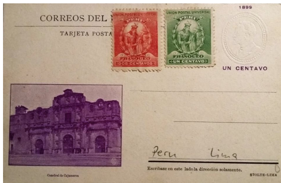
Back of an illustrated postcard, edited by Guillermo Stolte in the series "Recuerdos de Lima", dated in 1899. Includes engravings, back and front, based on photographs by Kroehle. In the image «Cathedral of Cajamarca», taken towards February of 1891. Percy Reinoso Collection (Paris).