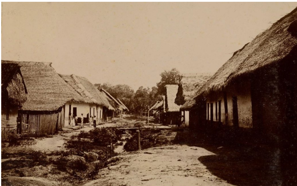
Belén Street in Iquitos. Kroehle & Huebner photograph, between November 1888 and June 1889. Taken from the album República Peruana 1900 .