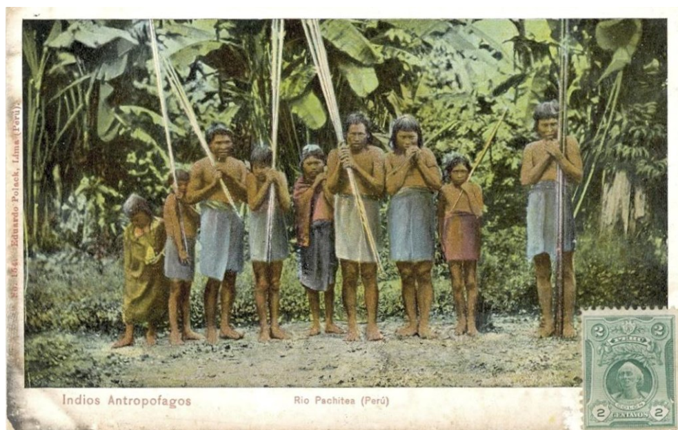
The same image, in the format of a colored postcard, edited by Eduardo Polack, at the beginning of 1900.