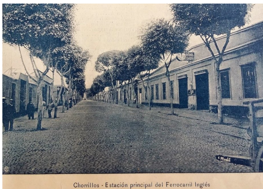
"Chorrillos – Estación principal del Ferrocarril inglés". Taken from Álbum de Lima y sus alrededores (c.1899).