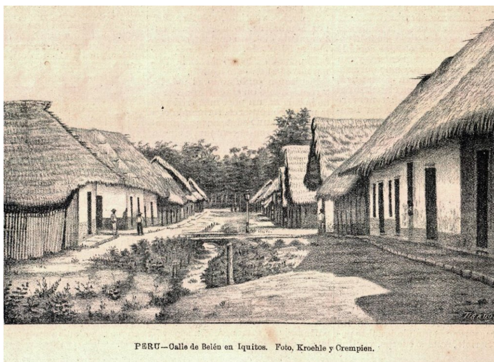
The same lithographed view published in El Perú Ilustrado (June 13, 1891), awarded to Kroehle & Crempien.